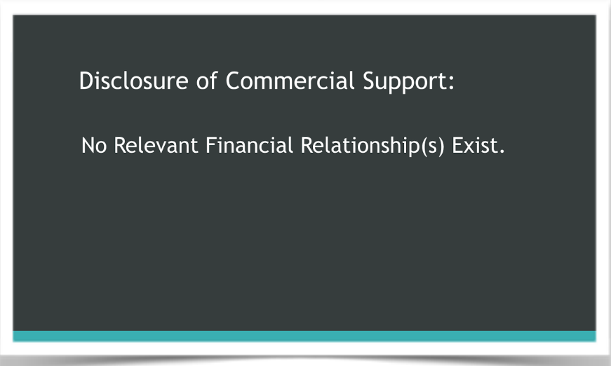
Figure 2. Example of Disclosure

commercial product (as contrasted with the generic product/drug entity and its contents or the general therapeutic area it addresses), or a specific commercial service (as contrasted with the general service area and/or the aspects or problems of professional practice it addresses).