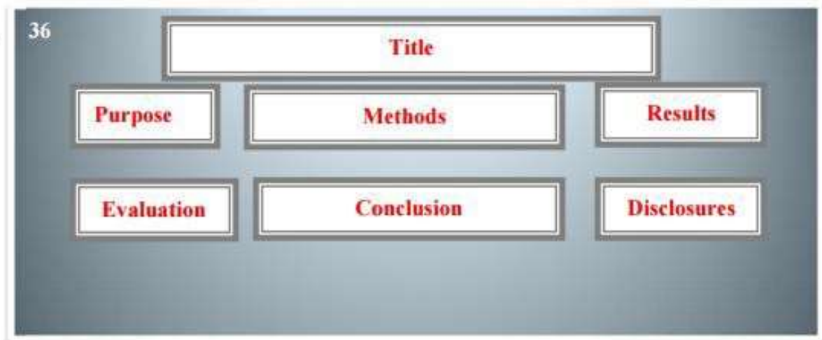
Figure 2 Sample research poster layout, taken from ASHP Poster Presenter Handbook, created for ASHP Midyear Clinical Meeting 2015.